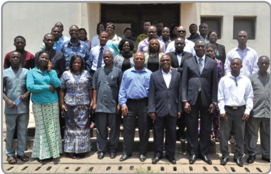
Photo: Participants at the fourth STEPRI and MOFA Policy Symposium

Participants were drawn from Ministry of Food and Agriculture (MoFA), Ministry of Finance (MOF) and Ministry of Trade and Industry (MOTI). Others include rice farmer, representatives of Ghana National Association of Poultry Farmers (GNAPF), Technical Adviser from USAID/APSP Project and other stakeholders. It was evident that the importation of rice and poultry has price, revenue and trade effects. With population growth rate of >2\% in Ghana, demand for variety of foods including rice and poultry meat will increase. Importation of rice and poultry cannot be stopped but policy makers need to enforce non-tariff and tariff barriers. It was recommended that inward looking policies should be intensified to increase local production of rice and poultry, promote dietary diversification and consumer education on quality and health implications of locally produced foods.