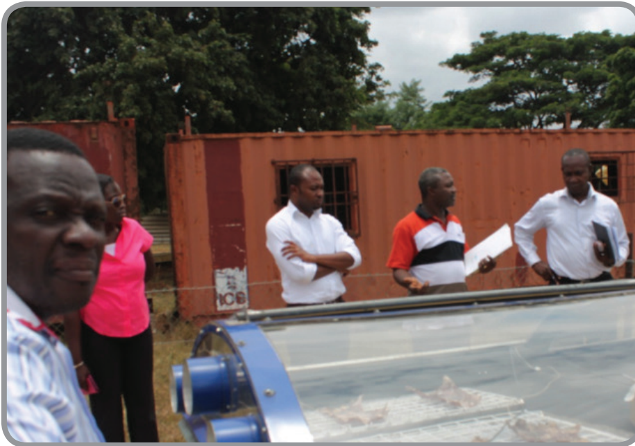
Photo: Meat in the solar dryer for trials by CSIR-TDTC Awardee

A total of 17 out of the 18 CSIR-TDTC projects were monitored. Most of the research-industry partnerships had not started generating income except for the pozzomix and mushroom clusters. From the monitoring report, twelve (12) projects out of the seventeen (17) CSIR-TDTC approved projects monitored were rated good and four (4) projects rated below Average. Only one (1) project was rated poor.