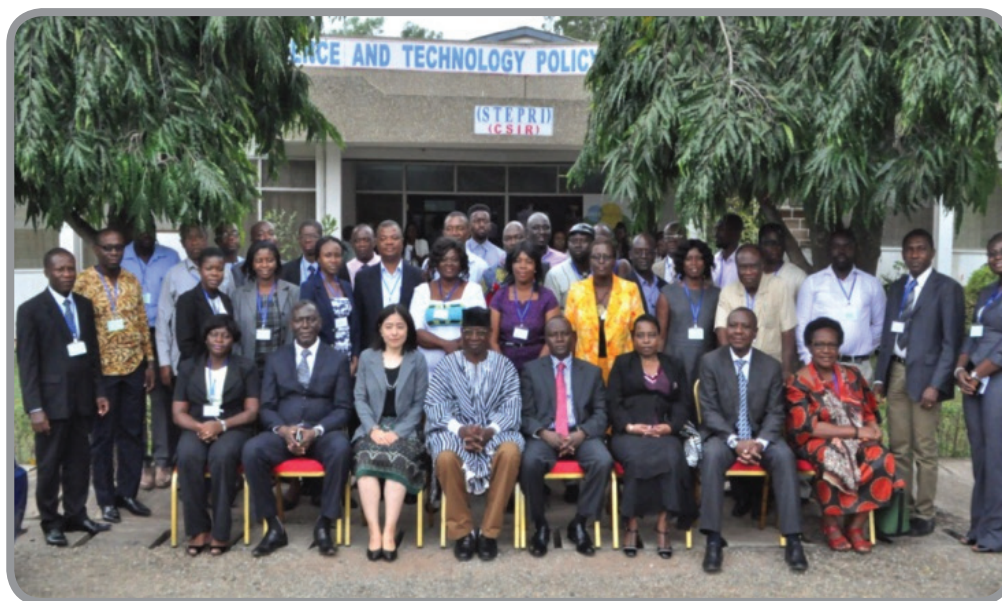
Photo: Opening of the MNEmerge Regional Workshop held in Accra, CSIR-STEPRI