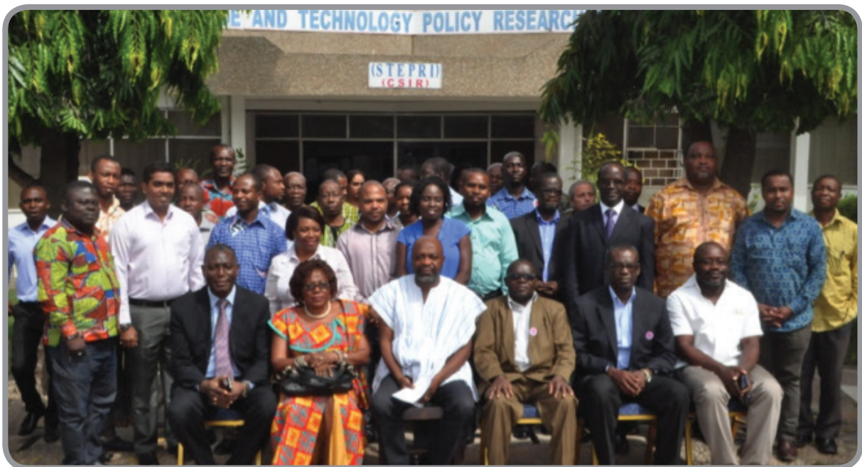
Photo: Participants at Research-Industry Interactions in Accra

A research-industry interaction was organised on 8th December, 2015 at the CSIR-STEPRI Auditorium in Accra. This created opportunities for researchers and industry players to advance useful exchanges that enhance understanding of the technological needs among local industries, how best to harness and exploit local research technologies for business solutions and encourage research and innovation in areas of relevance for industry and private sector growth. The forum hosted Directors of CSIR institutes and/or their representatives, awardees, entrepreneurs from the Association of Ghana Industries (AGI) and EDAIF. Some recommendations made in respect of facilitating research-industry partnerships included, strengthening partnership between CSIR and AGI by creating a desk that coordinates the needs of the two; the need for some kind of policy intervention to ensure that technologies developed by CSIR are used by industry, especially for public funded projects, and if it exists, it should be enforced.