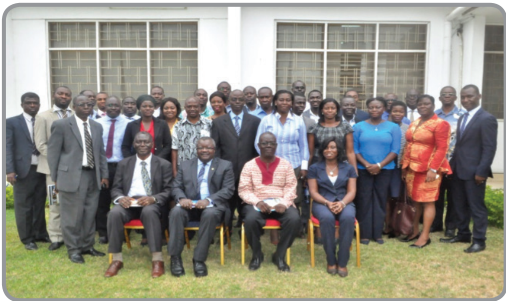
Photo: Participants at the third MOF Policy Symposium

While the current exchange rate has received much attention in the public and media frontlines, far less attention has been directed at examining the trend and history of exchange rate in Ghana over years. This policy symposium explored three key issues including the evolution of exchange rate, exchange rate volatility on macroeconomic stability and why the misalignment of the exchange rate matters to the Ghanaian economy. These issues have been identified as key in discussing a country's relative level of economic health.