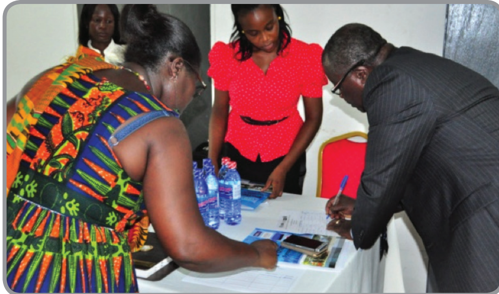
Photo: Registration for the Second MOF Policy Symposium in progress