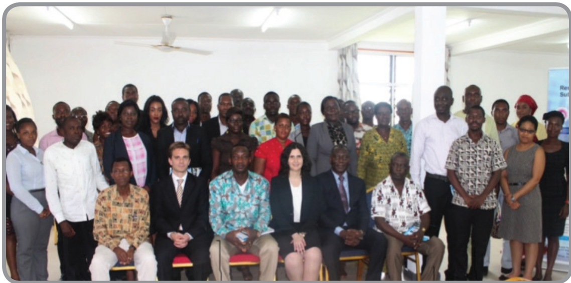
Photo: Participants from the Third MOTI Policy Symposium