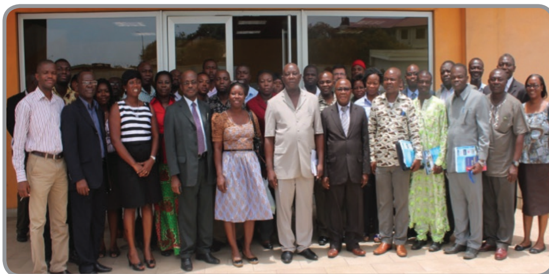
Photo: Participants at the Third MOFA Policy Symposium under DRUSSA Project