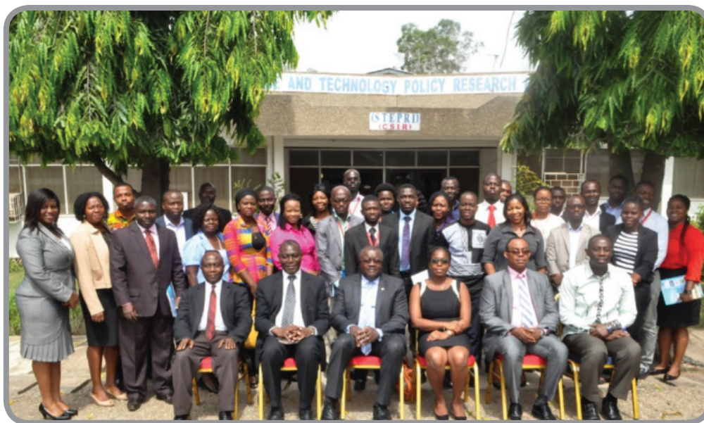
Photo: Participants at the fourth MOF Policy Symposium